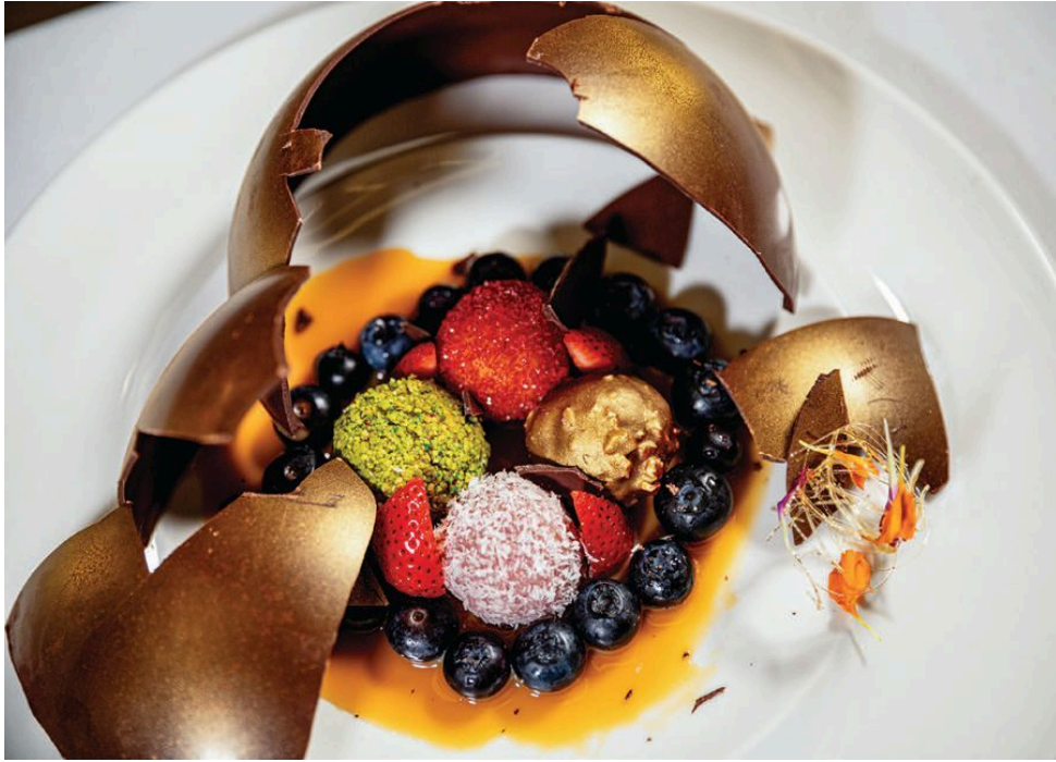
The sweet confection at Sanjh is a must.