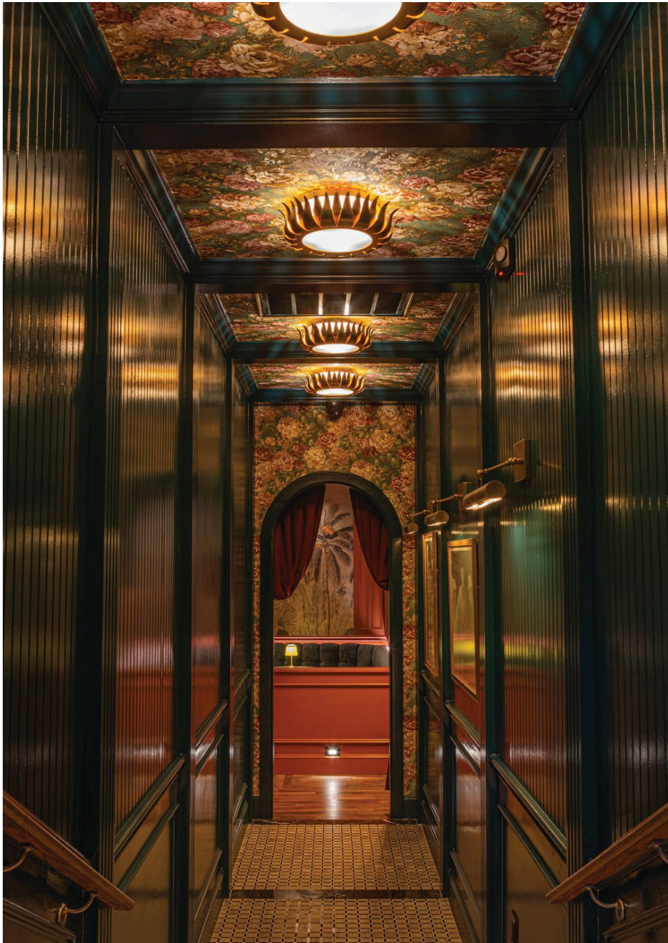
Columbian Country Club sits pretty in East Dallas and features a vast selection of sips and bites.