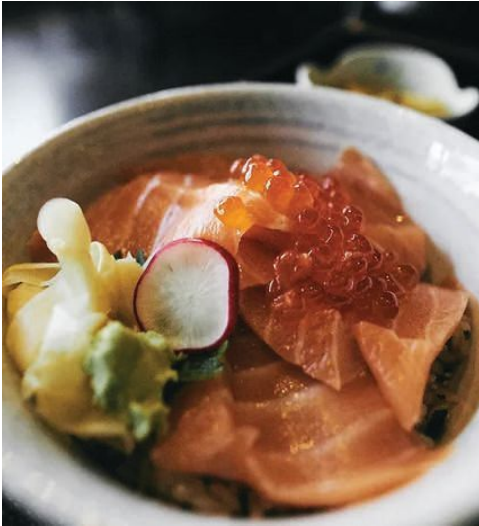
JingHe hosts myriad options including the salmon sashimi.