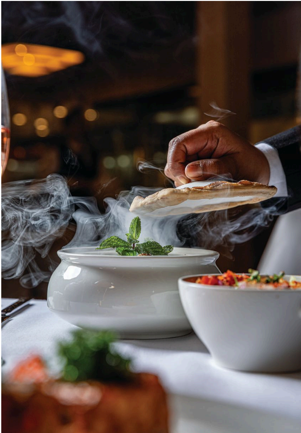
The Biryani from Sanjh is served in a sizzling manor.