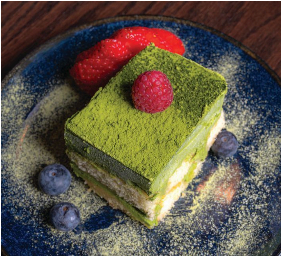
Matcha tiramisu? Yes, please.